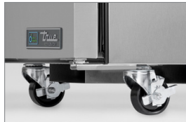
ADA 3" Castors