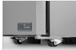
Low Profile (LP) 1½" Castors Upcharge applies for (LP) size castors