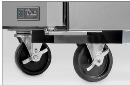
Standard 5" Castors