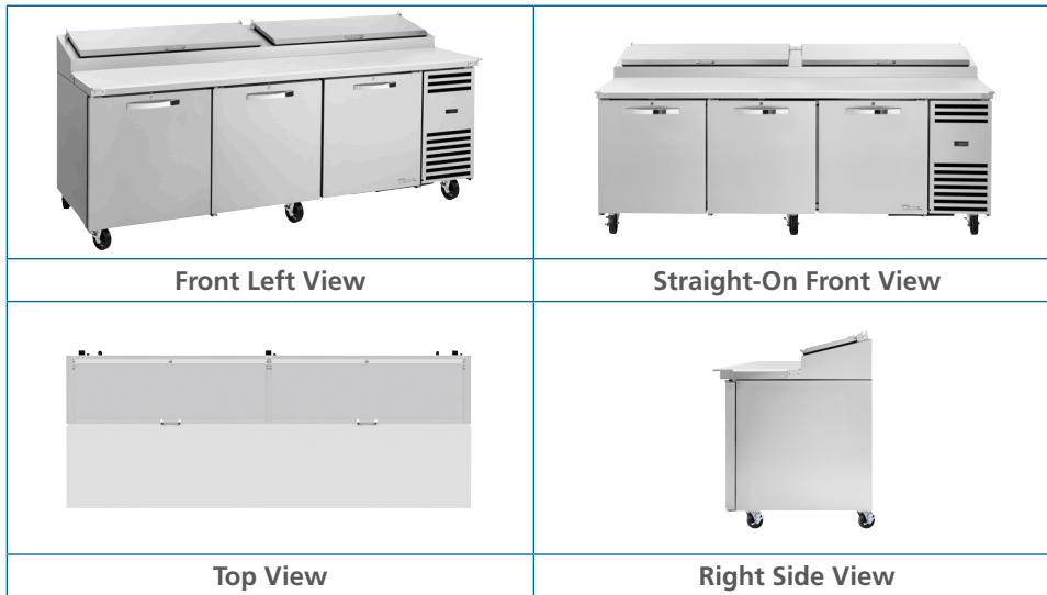
Front Left View