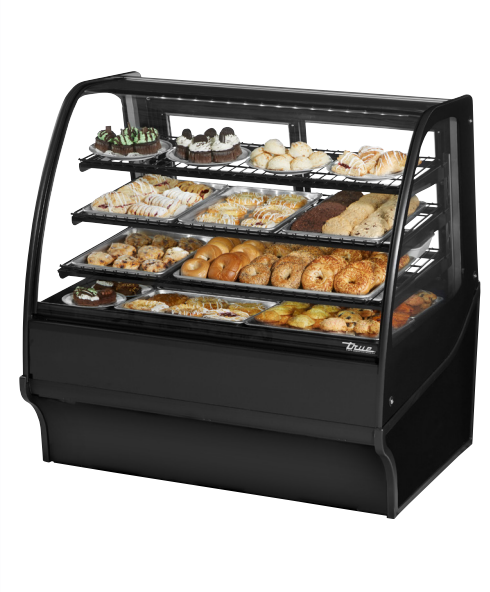
TDM-DC-48-GE/GE-B-B (optional black interior)

FEATURES ▶ True's "dry" display case combines efficient, high volume merchandising with an elegant curved glass front for sophisticated presentation of high end desserts and pastries. ▶ Cabinet is NSF/ANSI Standard 2 compliant to hold open food product. ▶ Two (2) rear sliding glass doors for back access. ▶ Exterior - powder coated FDA black rounded front and back, black aluminum aesthetic side and front panels. Color options available (upcharge may apply) - white or stainless. ▶ Interior - powder coated FDA white over CRS material. Color options available (upcharge may apply) - black or stainless. Curved glass front and side glass panels. ▶ Interior - powder coated FDA white over CRS material. Color options available (upcharge may apply) - black or stainless. ▶ Three (3) tiered levels of adjustable wire cantilever shelves that match cabinet interior color. Chrome plated wire shelves standard on stainless units. ▶ Front glass swings Up for easy cleaning access. ▶ LED interior lighting provides more even lighting throughout the cabinet. Safety shielded.