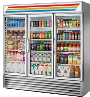
Optional Stainless Exterior