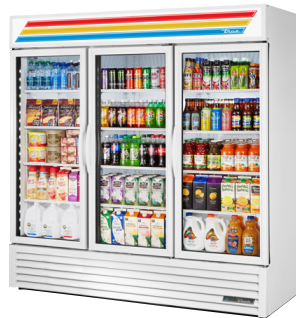
Optional White Exterior