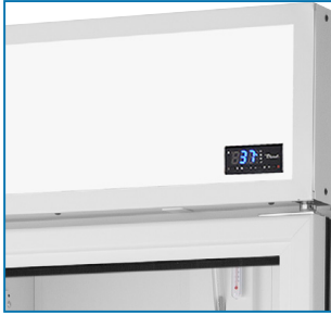
Standard: Display in sign frame.

Swing Door Scientific Refrigerator with Hydrocarbon Refrigerant~True Standard Look Version 01